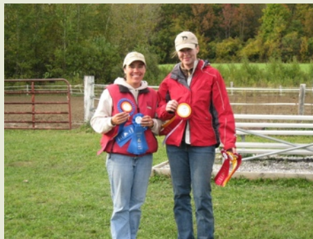
Winner Winner Chicken Dinner!!!